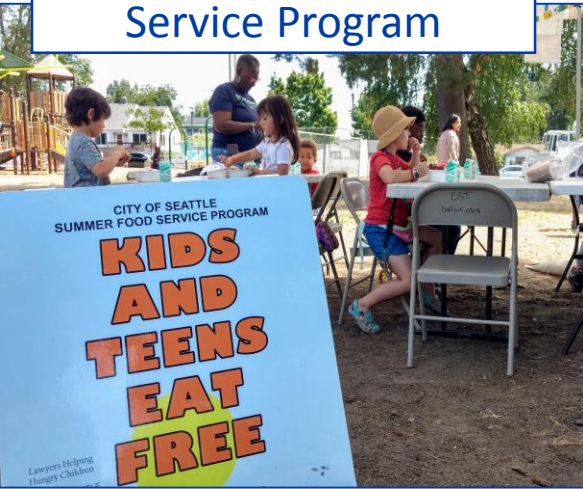
Summer Food Service Program