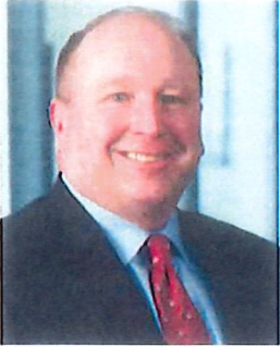
CHIEF OPERATING OFFICER