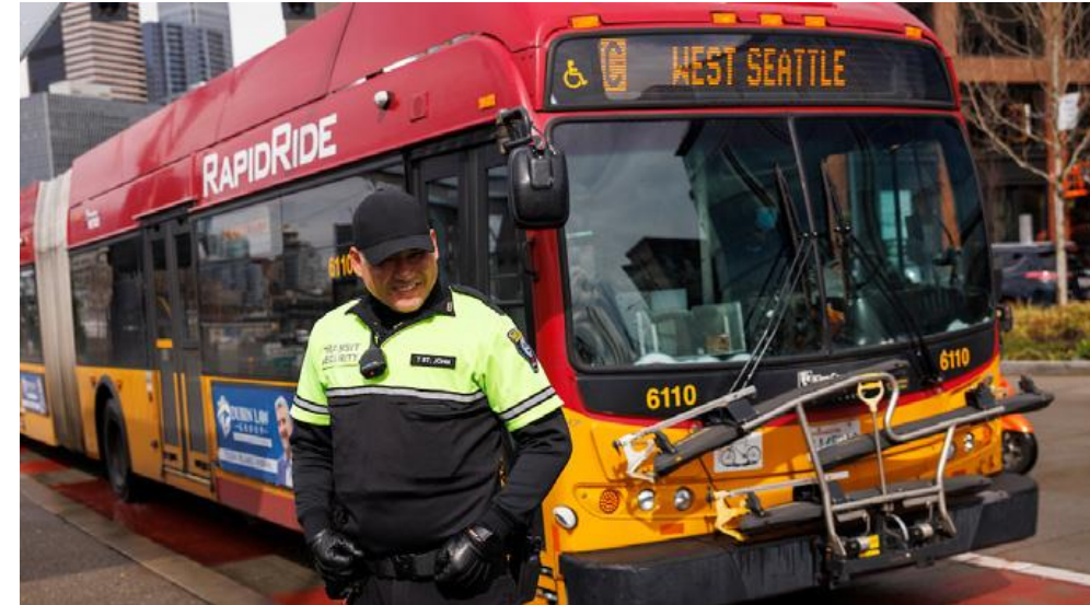
Metro Transit Security officers