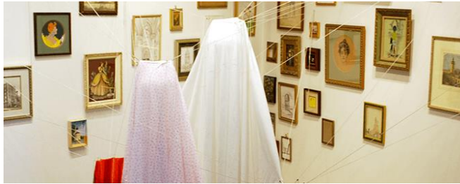
Dialogues in Art: Exhibitions on Homelessness

Seattle Office of Arts and Culture, Seattle Presents Gallery http://www.seattle.gov/arts/experience/galleries