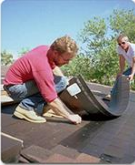
Installing solar shingles