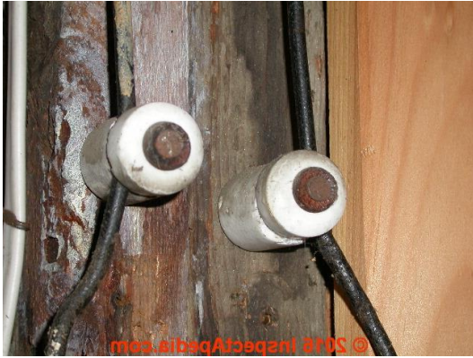
“knob and tube” wiring