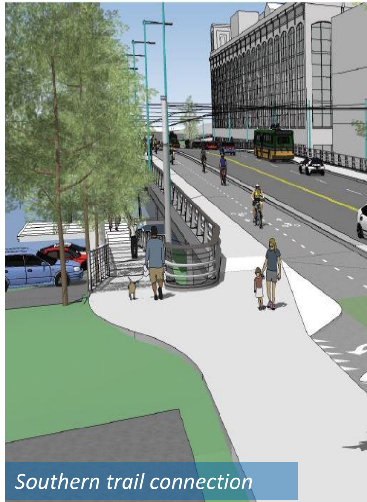
Southern trail connection