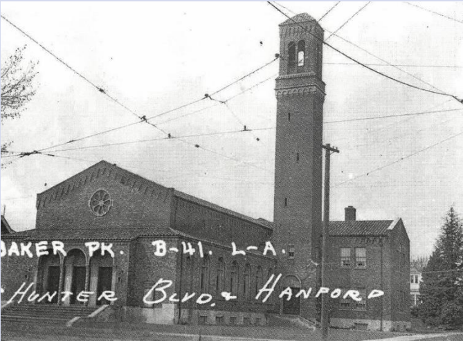
Historic photo, c. 1930s