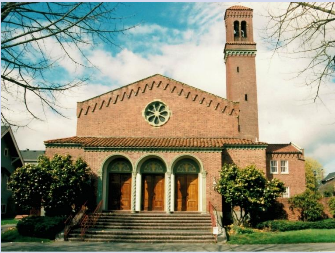
Current photo, 2003