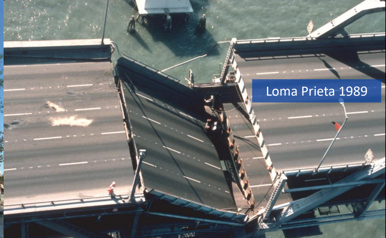
Loma Prieta 1989