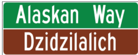
Figure 2: Street Signs Example

SDOT is required to manufacture, install, and maintain new, official street name signs. The 2023 Adopted Budget includes appropriation necessary to pay for the signs. Council adoption of RES 32080 would require SDOT to manufacture, install, and maintain 42 honorary signs at a cost of $10,000 from the Waterfront Project budget.