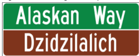
Figure 2: Street Signs Example

SDOT is required to manufacture, install, and maintain new, official street name signs. The 2023 Adopted Budget includes appropriation necessary to pay for the signs. Council adoption of RES 32080 would require SDOT to manufacture, install, and maintain 42 honorary signs at a cost of $10,000 from the Waterfront Project budget.