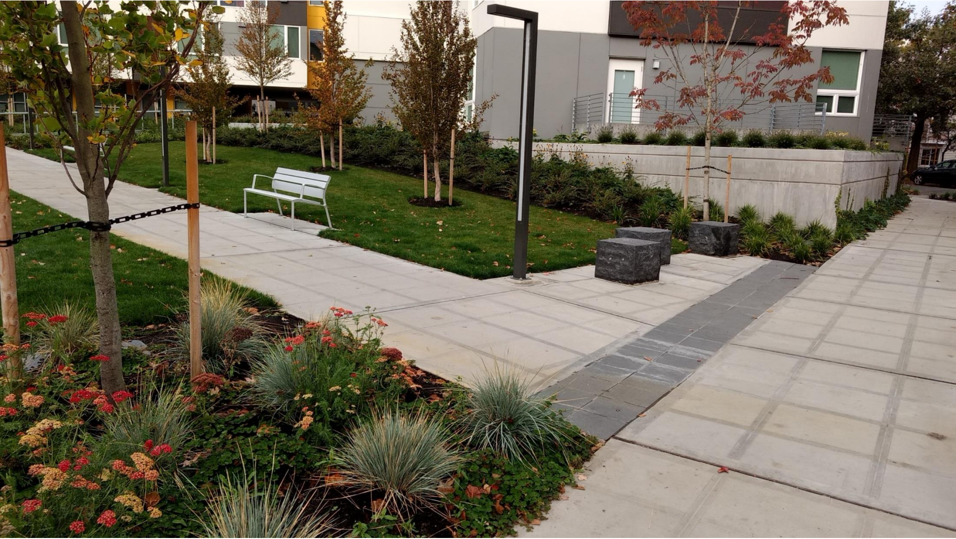
Inviting entrance with benches and stone elements along E Denny