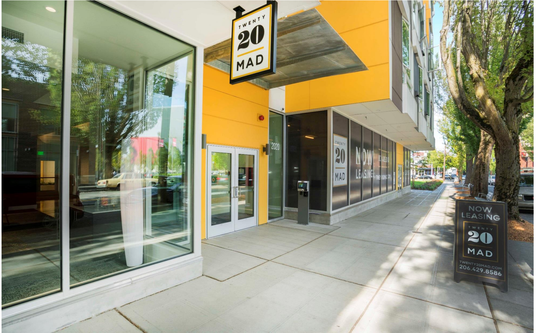
Widened sidewalk along E Madison