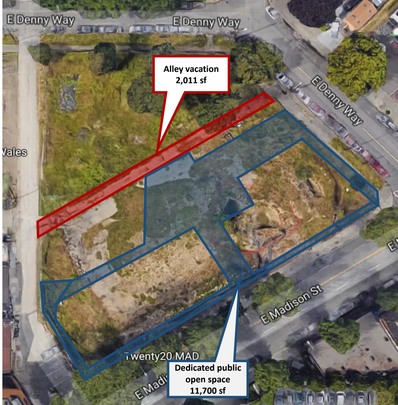
Aerial Photo of pre-development site with Alley Vacation and Dedication