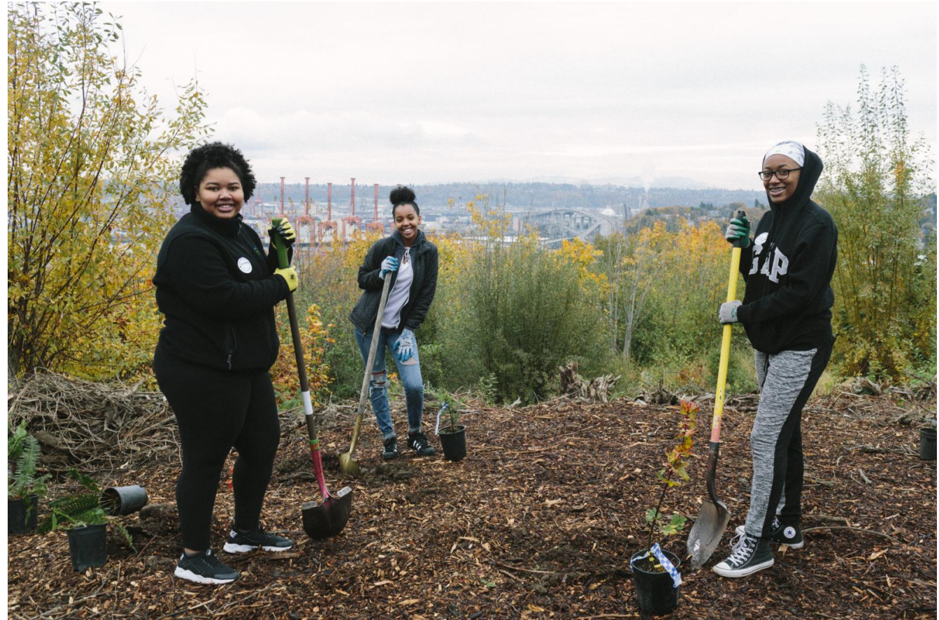
Duwamish Head Greenbelt Work Party