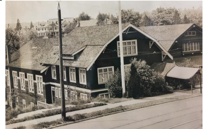
Historic photo, 1929