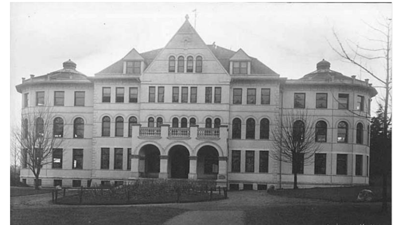
Historic photo, 1918