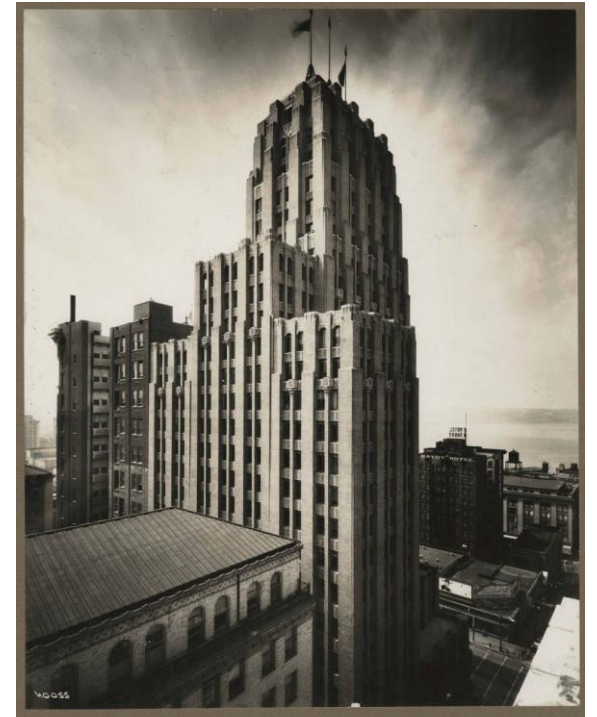
Property of The Seattle Public Library