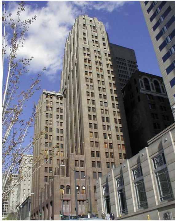
Contemporary photo, 2018