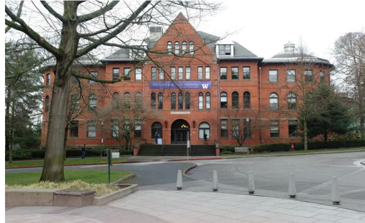
Contemporary photo, 2018