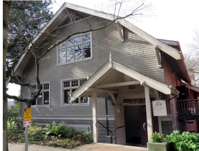
Contemporary photo, 2018