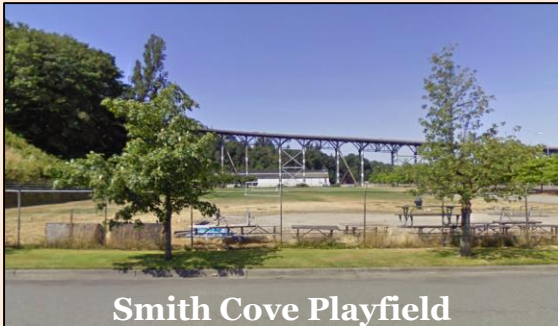
Smith Cove Playfield