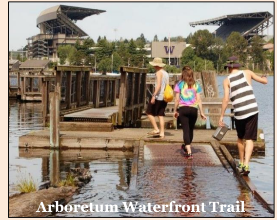
Arboretum Waterfront Trail