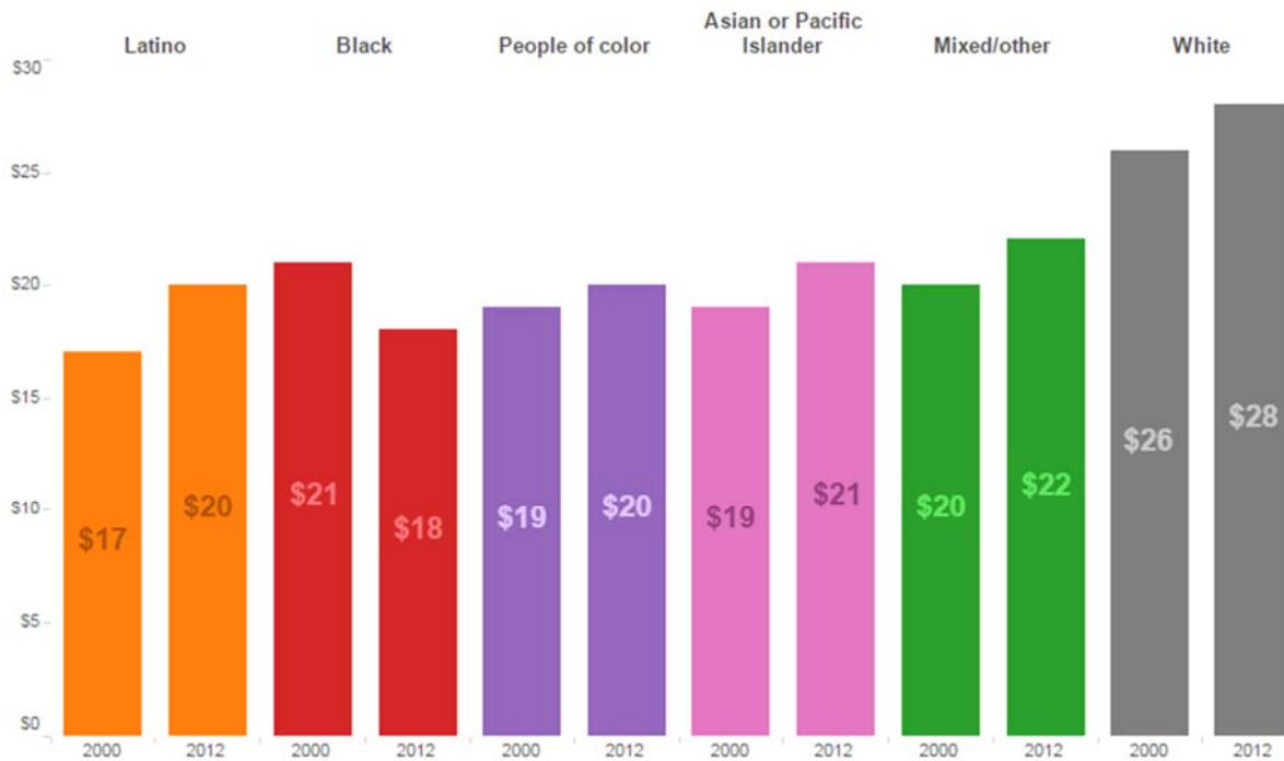
Race and ethnicity categories based on source data and do not necessarily match U.S. Census categories.

Washington State ranks 47 th in the nation in funding for mental health and substance abuse treatment services. 7 Untreated mental health and addictions are a leading cause of homelessness. Outreach workers have reported that as many as 90% of unsheltered people are struggling with these issues. The resulting impact is that increased numbers of people are living in marginalized situations, unstably housed and coping with untreated mental health and substance abuse conditions.