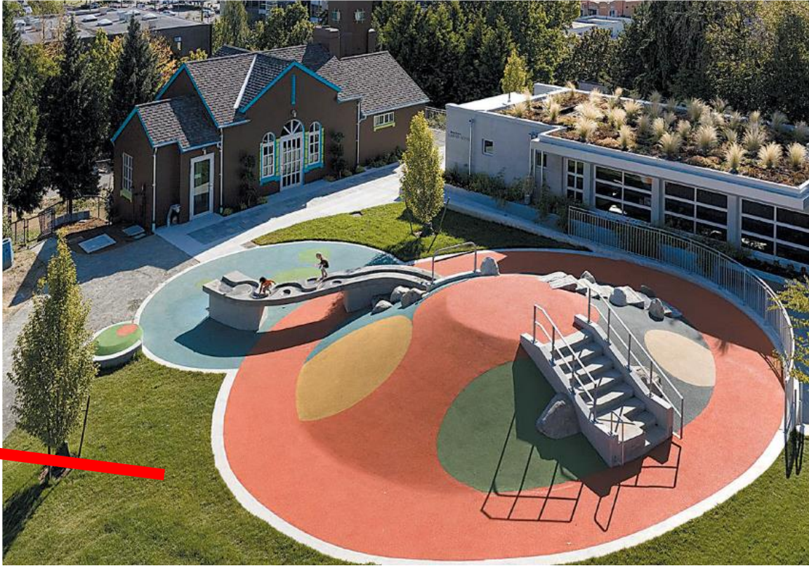
(Not to scale)