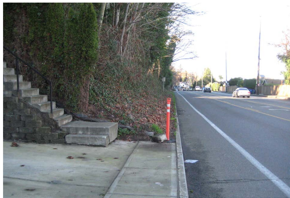
Debris flow from adjacent slope on sidewalk