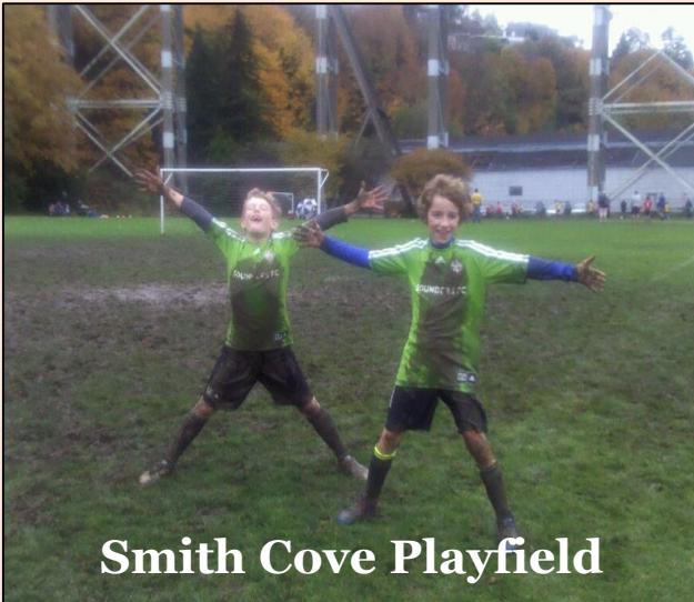
Smith Cove Playfield