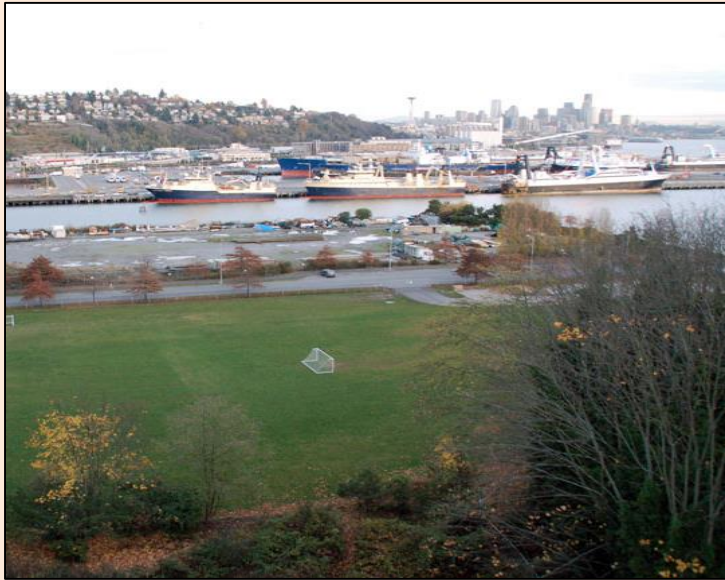
Smith Cove Playfield