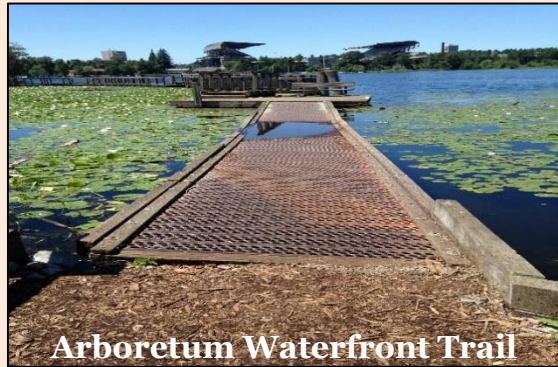
Arboretum Waterfront Trail