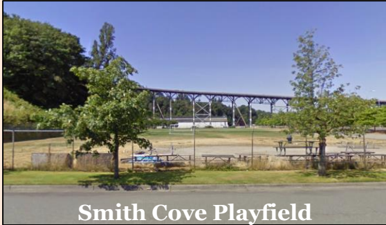
Smith Cove Playfield