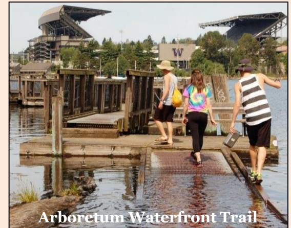
Arboretum Waterfront Trail