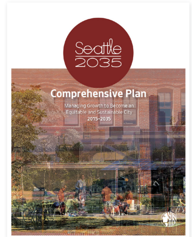
Cover of the Seattle 2035 Comprehensive Plan