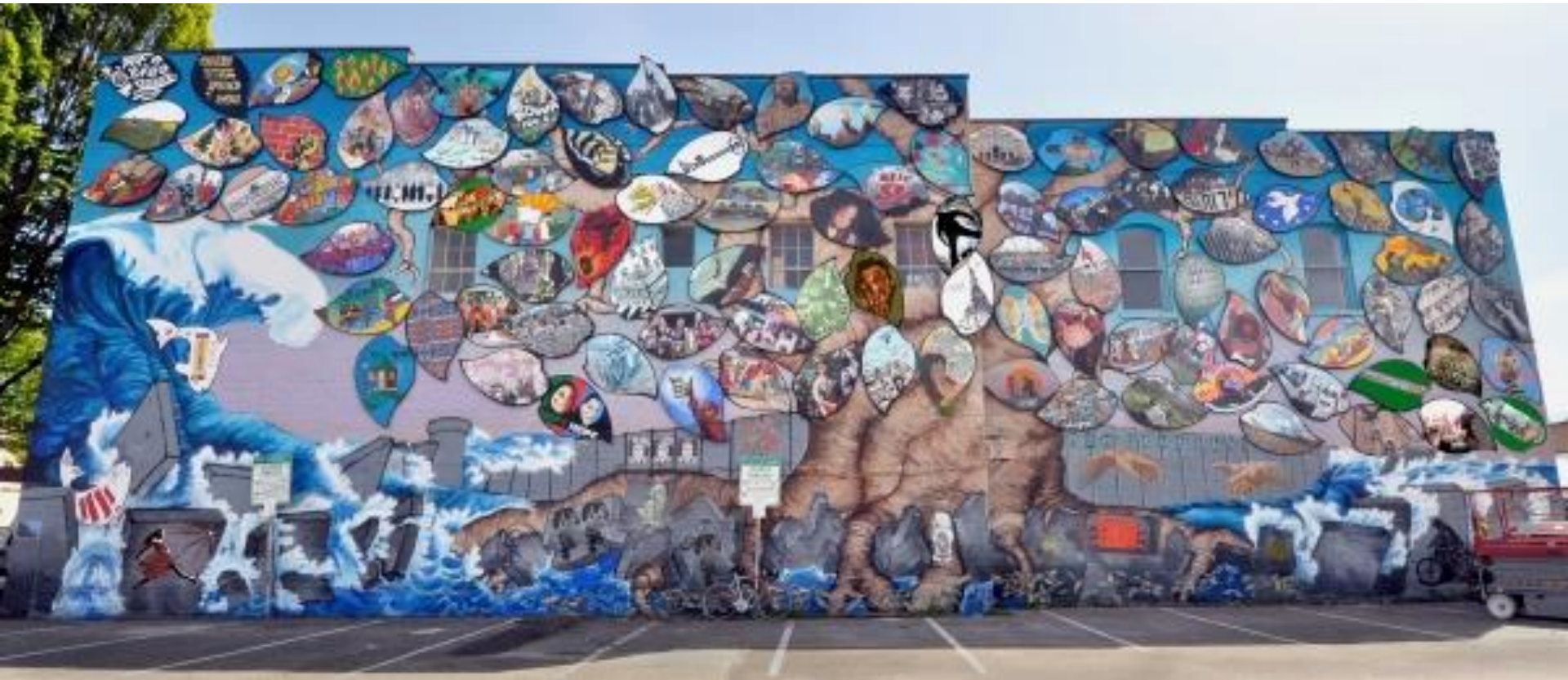
Olympia/Rafah Solidarity Mural 2010