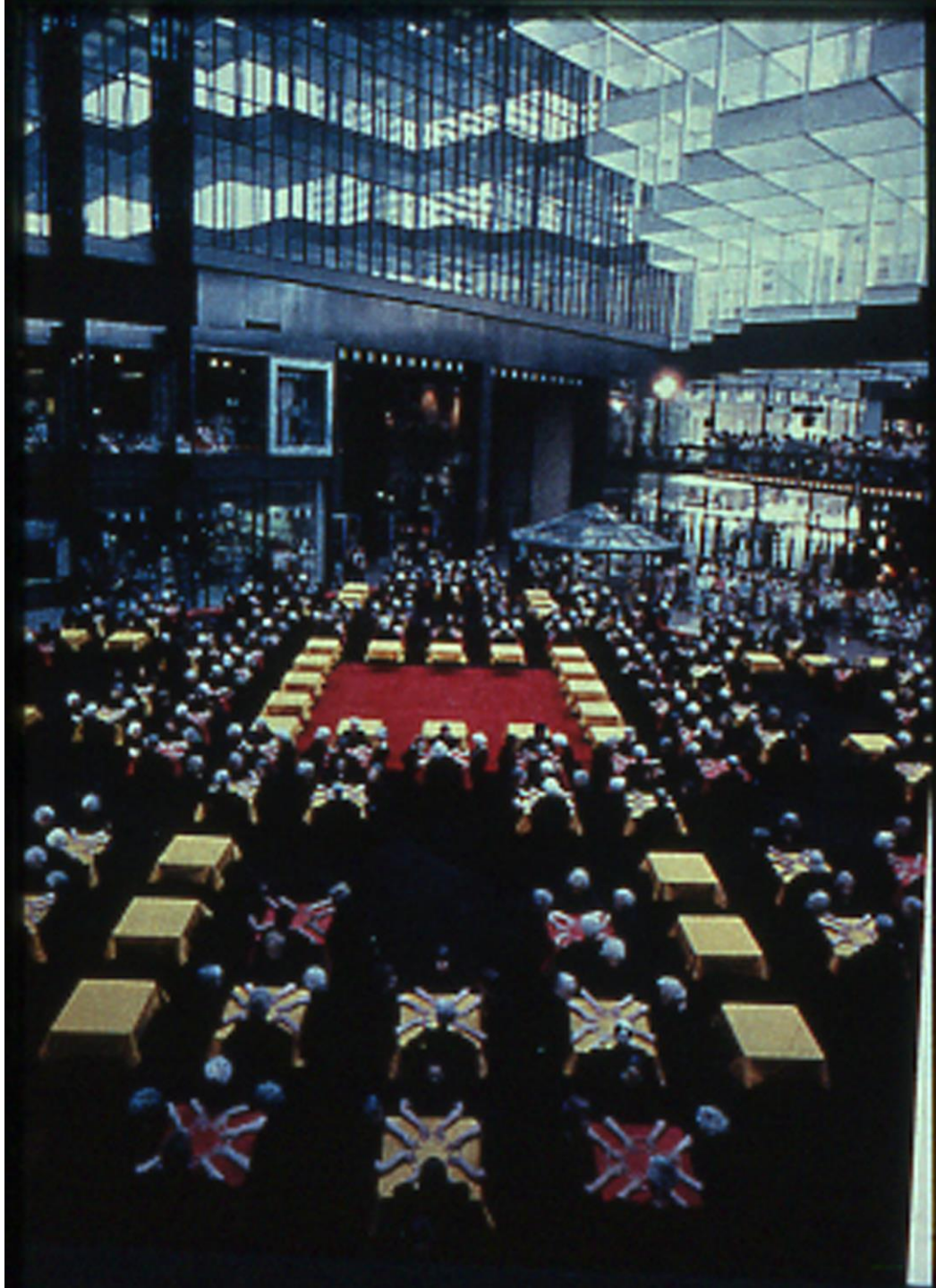
Suzanne Lacy The Crystal Quilt Minneapolis 1985