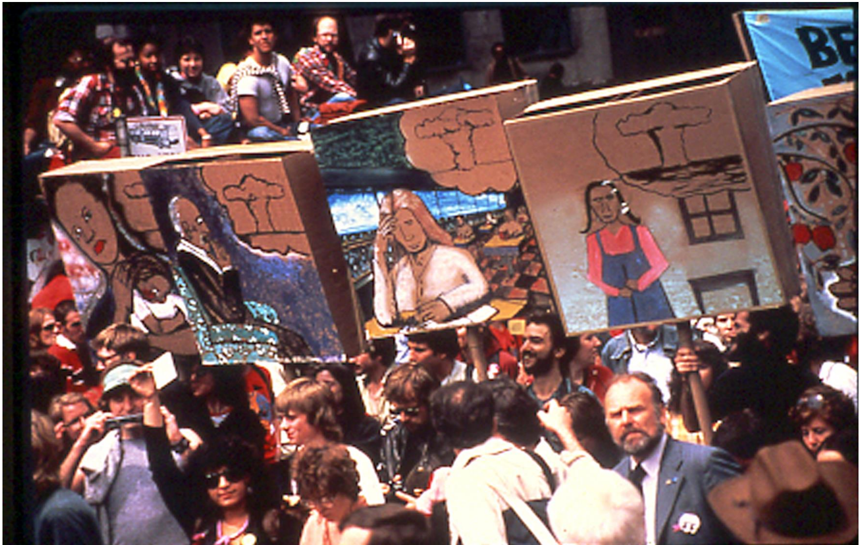
Anti-Nuke March, NYC, 1982 (2 million strong)