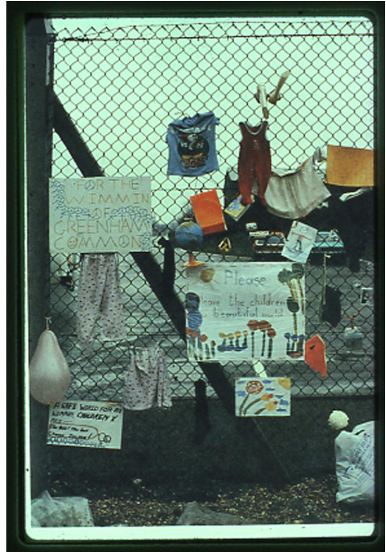
The Greenham Common Women's Peace Camp