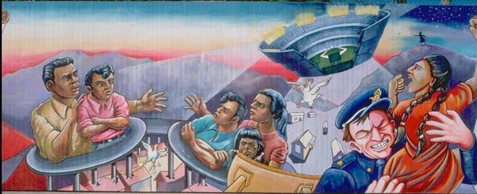
DIVISION OF THE BARRIOS & CHAVEZ RAVINE