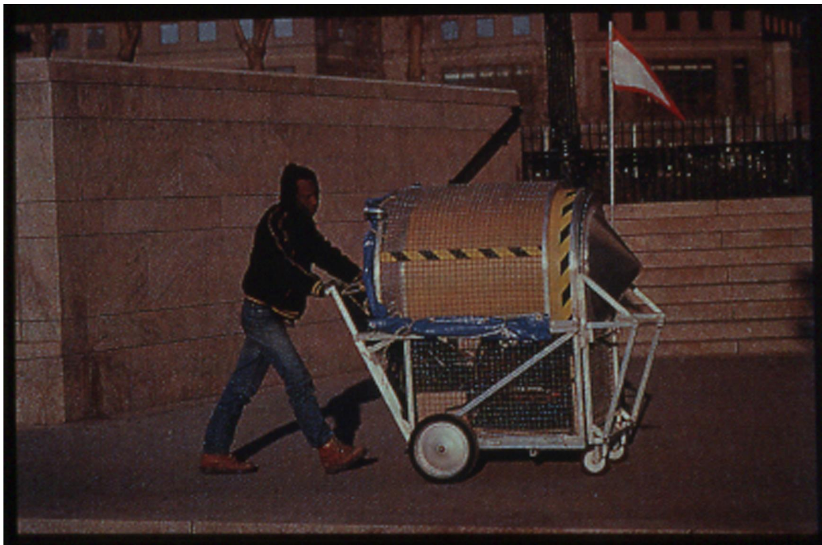
Krzysztof Wodiczko - Homeless Vehicle - 1987-88