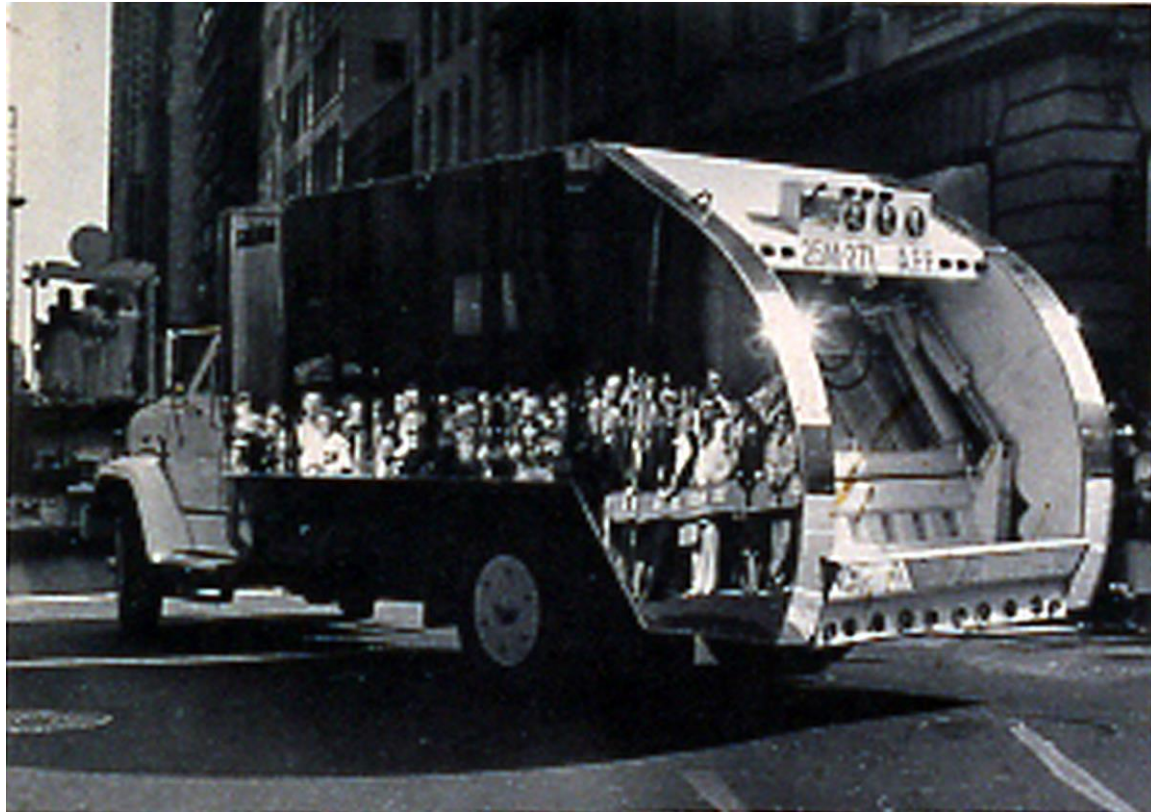
Mierle Ukeles - The Social Mirror - 1983