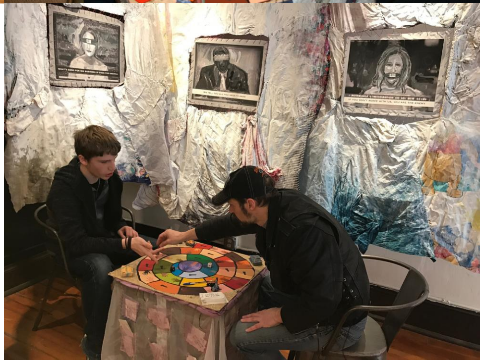
AND NOW Behind Curtain #45 2017