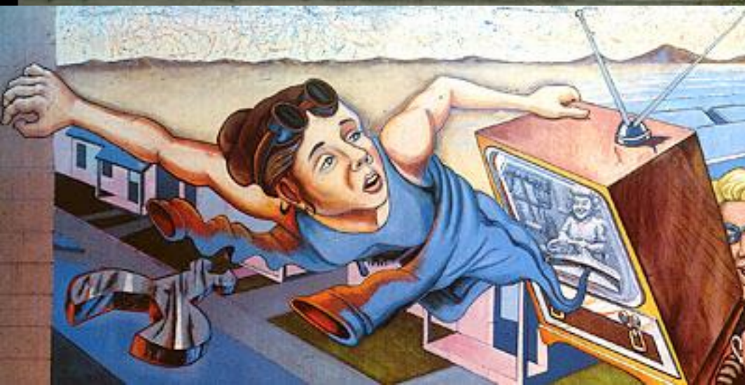
Judy Baca The Great Wall of LA 1976