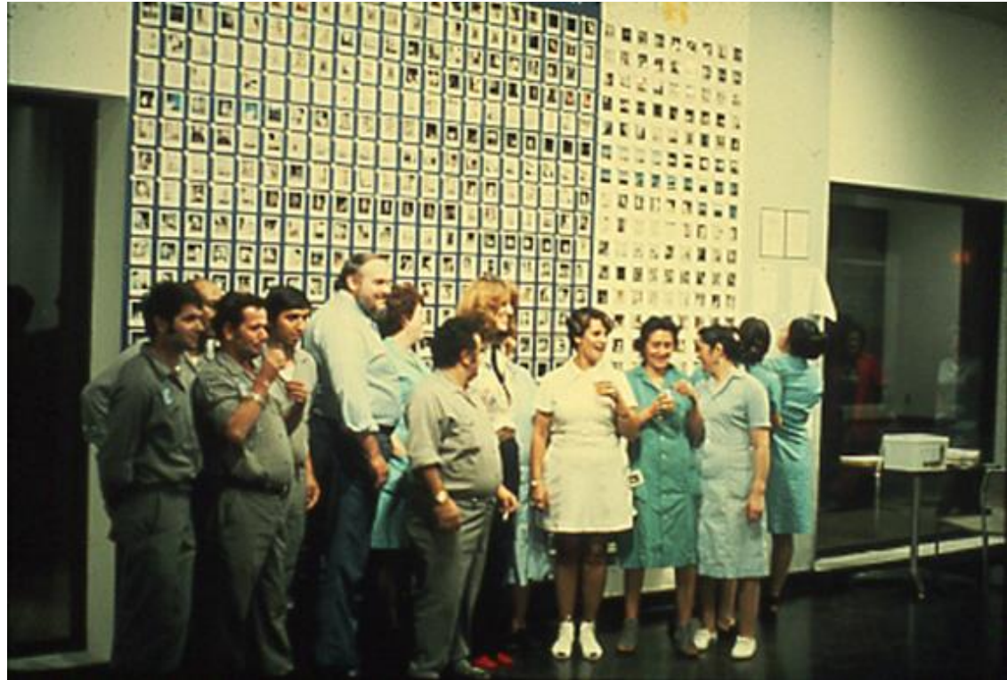
Mierle Laderman Ukeles Maintenance Art (mid-1970' s)