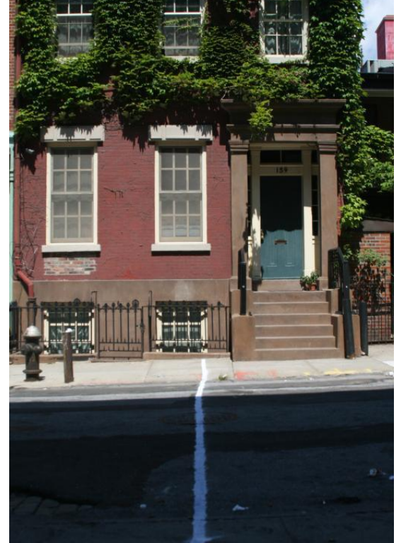
Eve Mosher High Water Line