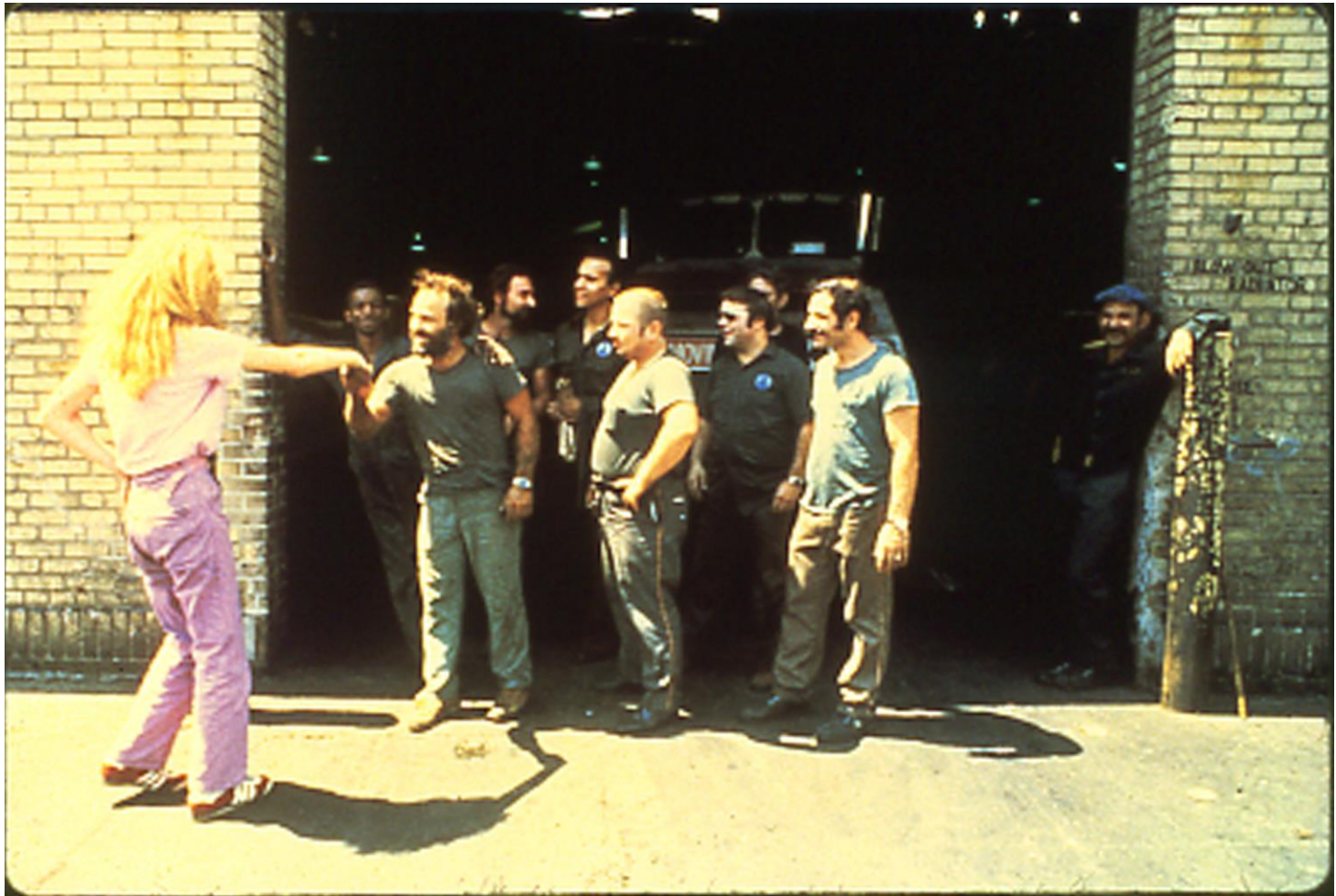
Mierle Ukeles - Touch Sanitation - 1979