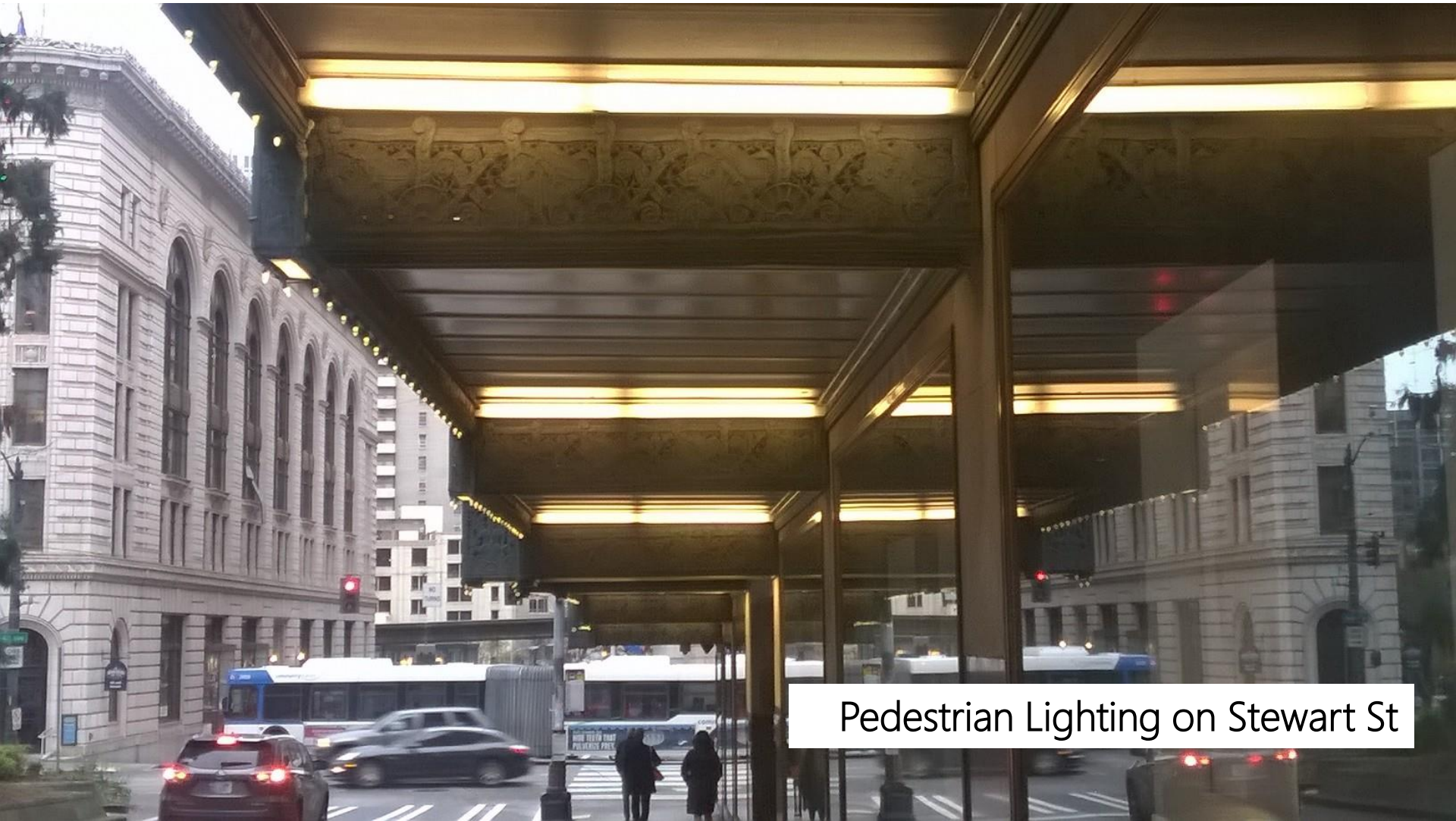
Pedestrian Lighting on Stewart St