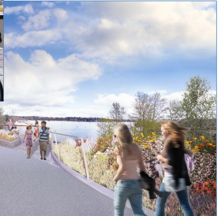
Rendering of multi-use path on the pedestrian land bridge