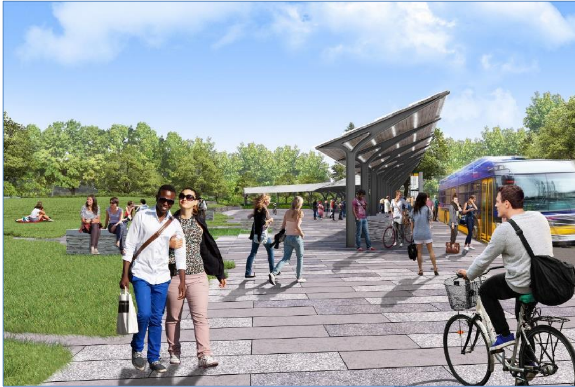
Rendering of transit hub on the Montlake lid