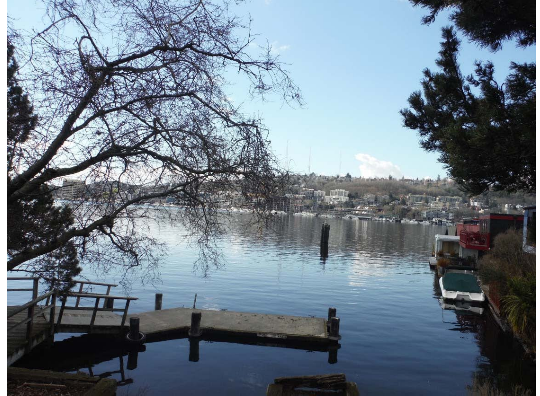
View of Lake Union from Terry Pettus Park