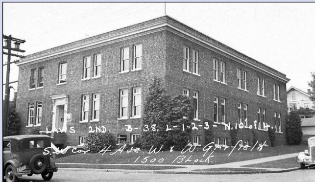
Historic photo, 1936