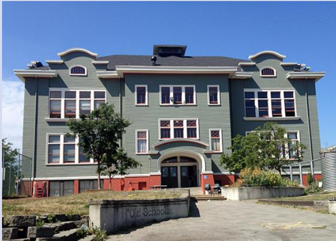
Current photo, date unknown