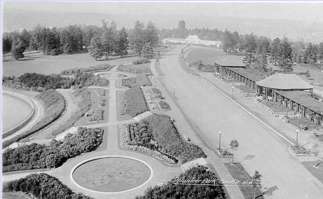
Historic photo, undated (pre-1931)