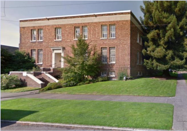
Current photo, 2016