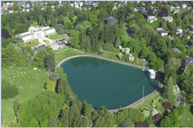
Current photo, 2001