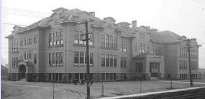
Historic photo, undated (circa 1908)