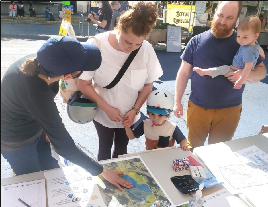
Lake City Floodplain Park community outreach