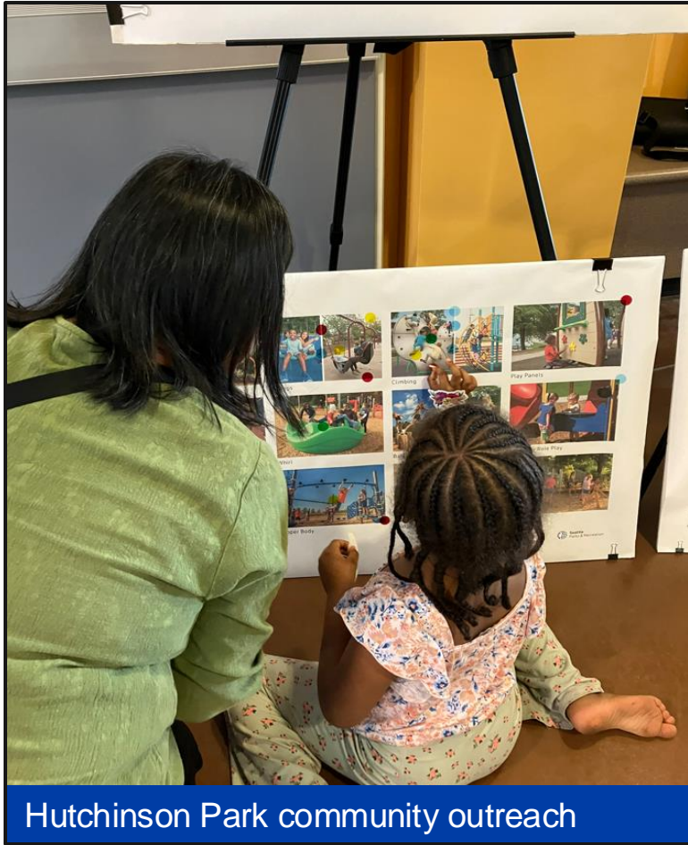
Hutchinson Park community outreach