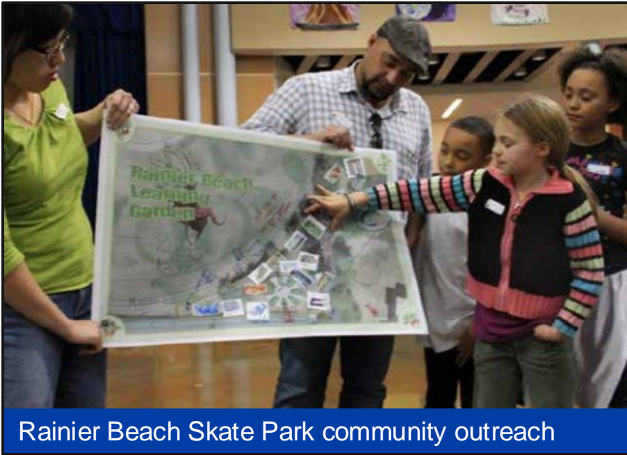
Rainier Beach Skate Park community outreach

Since 1966, Seattle Parks and Recreation (SPR) has received over $191M (in 2024 dollars) for 139 projects from RCO.