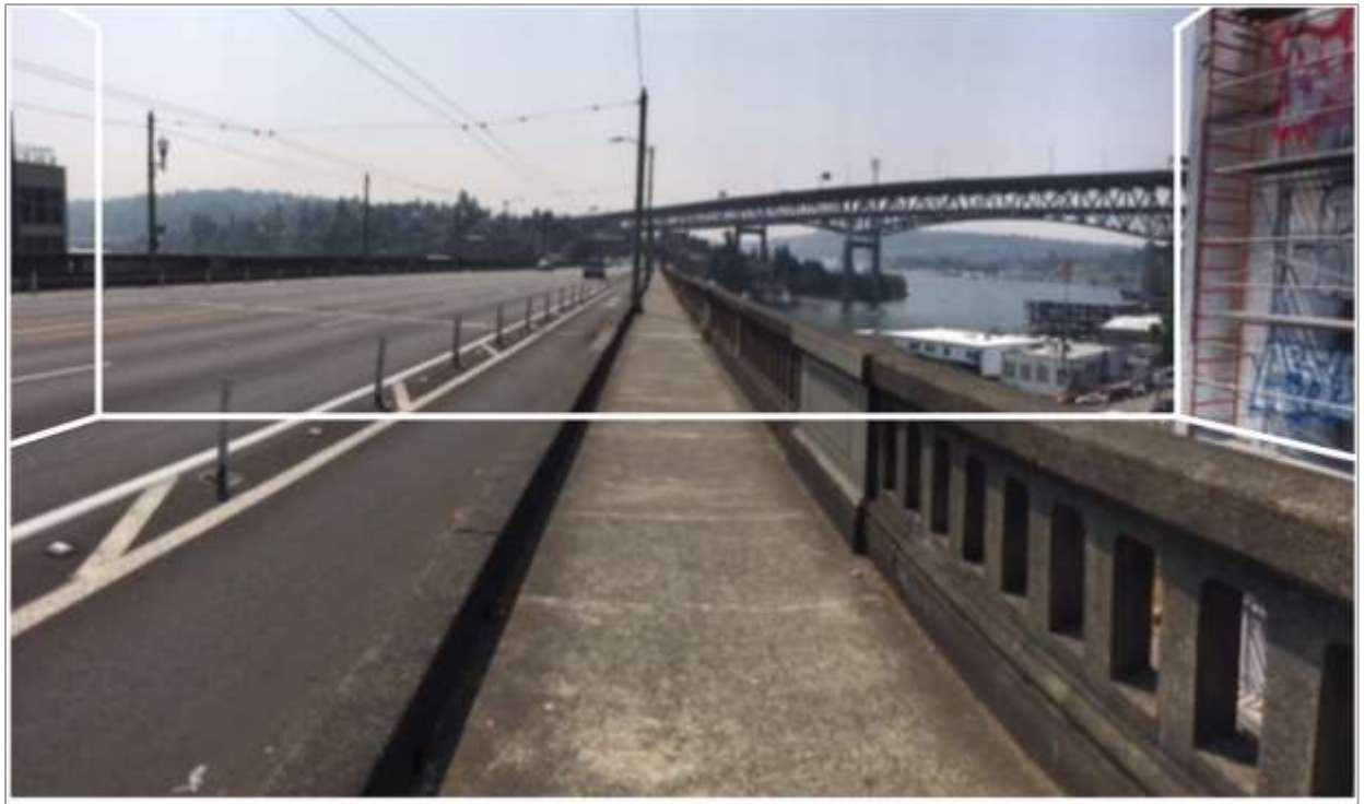
Figure 5: View Corridor #8

D. In addition to the general rezone criteria contained in Section 23.34.008, the comments of the Major Institution Master Plan Advisory Committee for the major institution requesting the rezone shall also be considered.