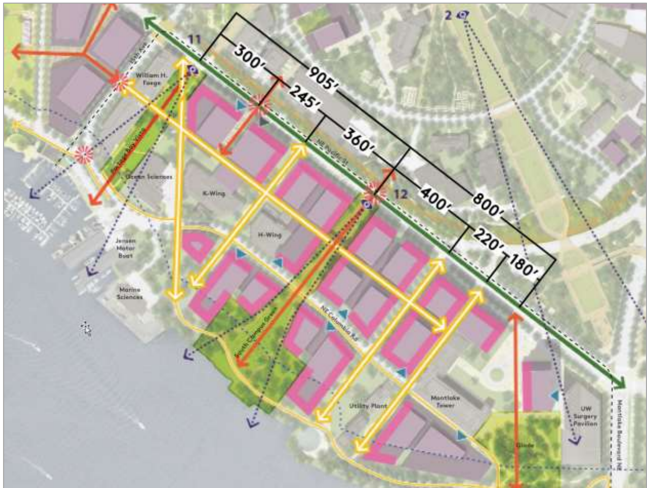
Figure 4: Mid-block Corridors and Pedestrian Connectors