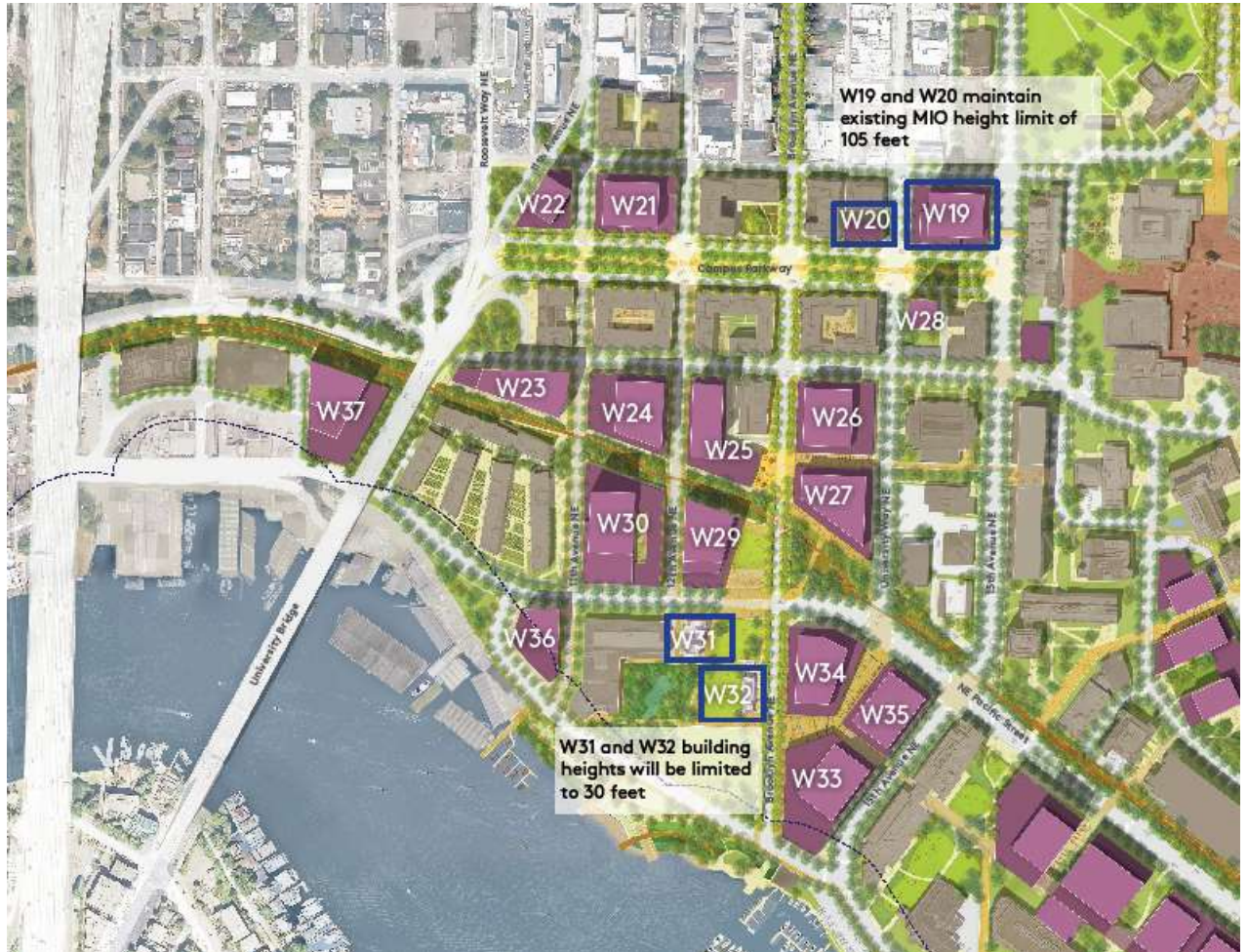
Figure 3: Recommended Conditions #21 and 22