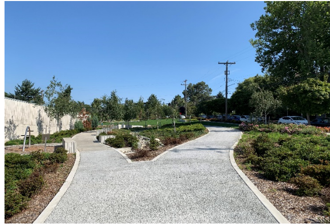
Olmstedian Walk, Landscaping – East property edge

☐ ~32,000 square foot public park-like open space