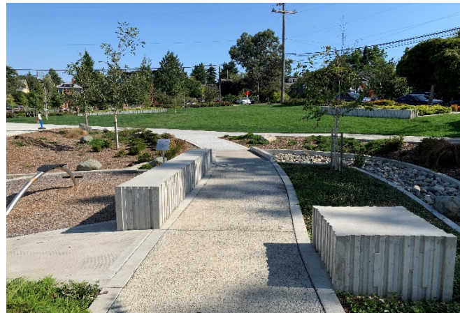
Olmstedian Walk, Fitness Stations, Play Lawn – NE property edge