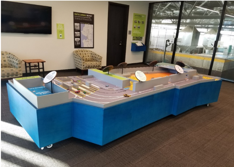
Admin Building, overlooking the Tipping Floor