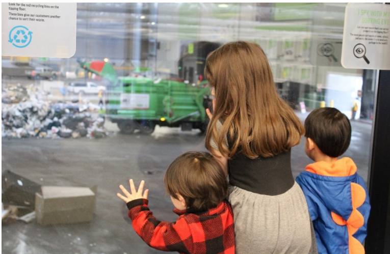
View of Tipping Floor