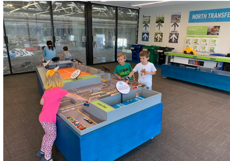
Example of educational material