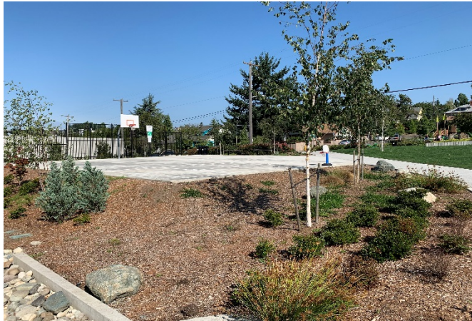
Multi-sport Court – NE corner of property