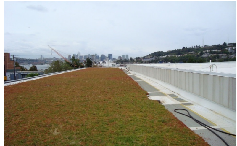
Green Roof on Admin Building