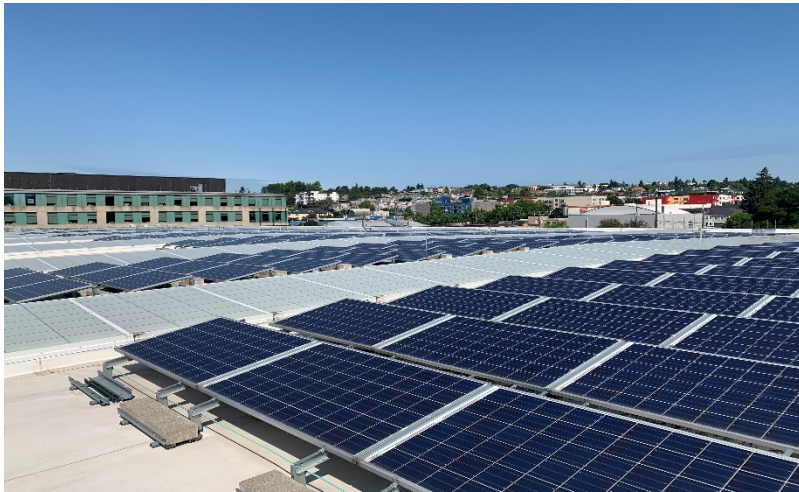
PV panel Systems on Building Roof