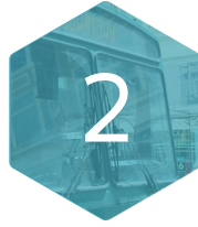
Employee-Paid Pre-Tax Program