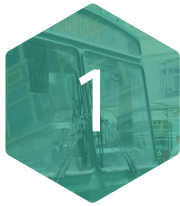
Employer-Paid Subsidy Program

Commuter benefits describe the tax allowances for commuting expenses outlined in IRS Code Section 132(f) 1 . Employers and employees can save money in three different ways: