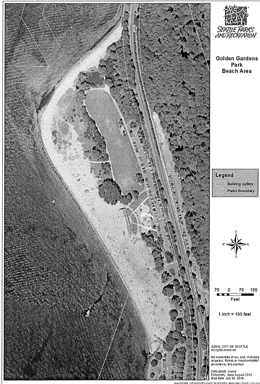
EXHIBIT A – Golden Gardens Park Map and Bathhouse Floor Plan