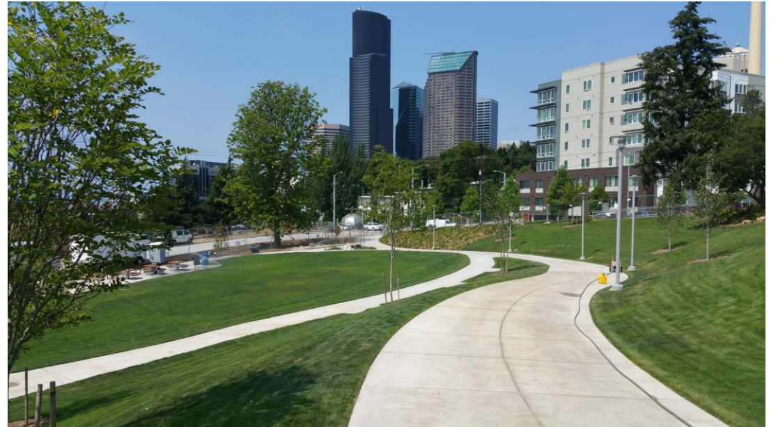
Open grass area