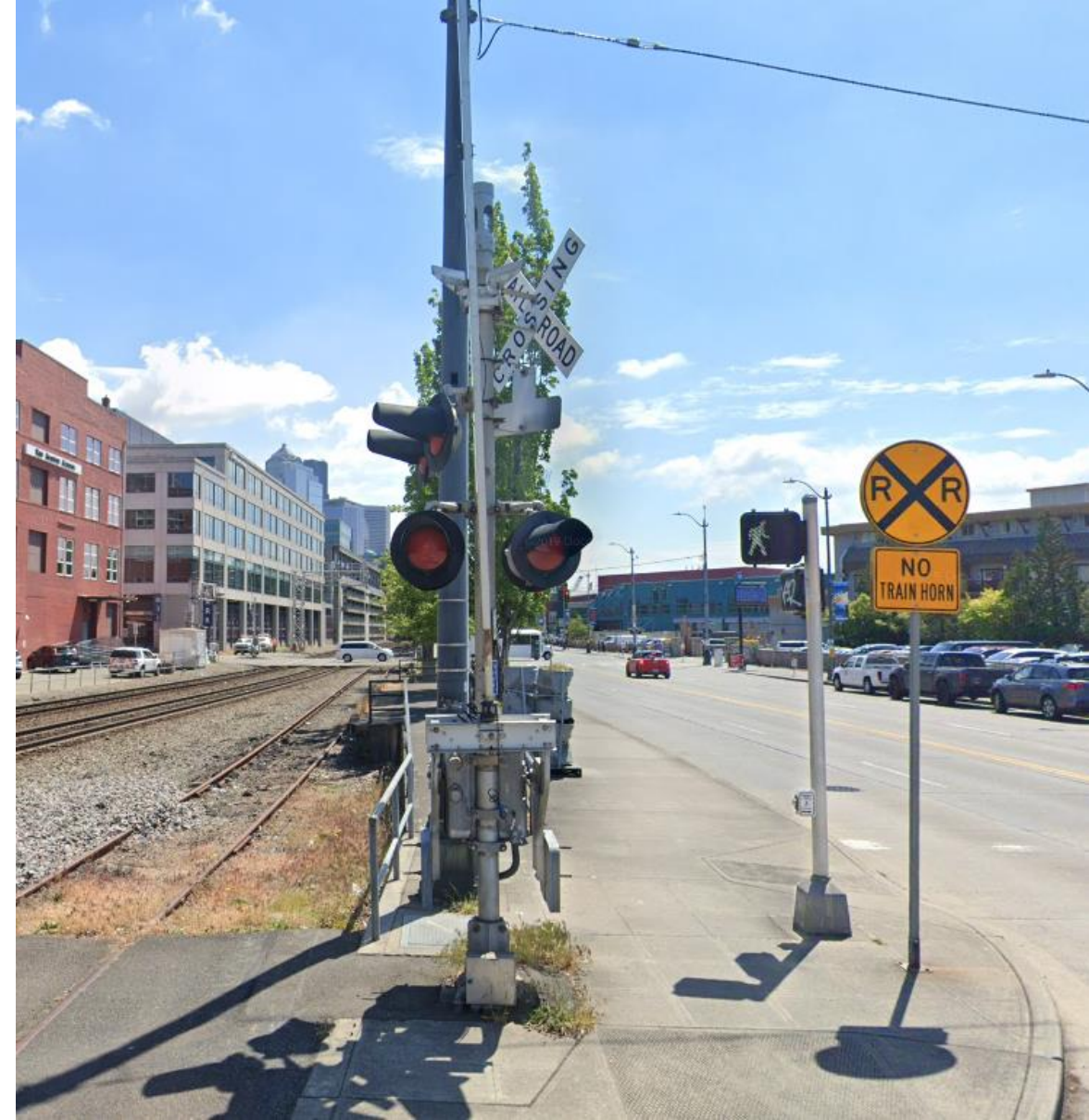
Vine St and Alaskan Way

A quiet zone is a segment of a rail corridor (minimum 0.5-mile) where locomotive horns are not routinely sounded at highway and rail grade crossings, except in emergency situations or to comply with other Federal regulations