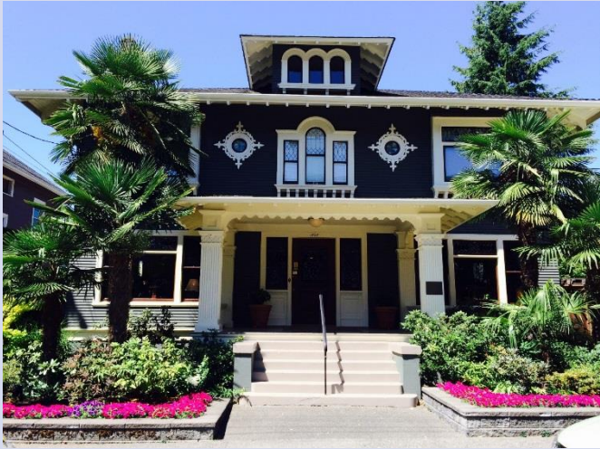
Current photo, 2015