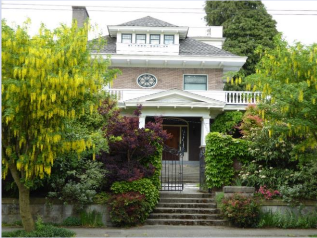
Current photo, 2015