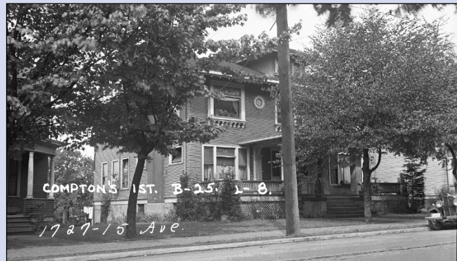
Historic photo, 1937