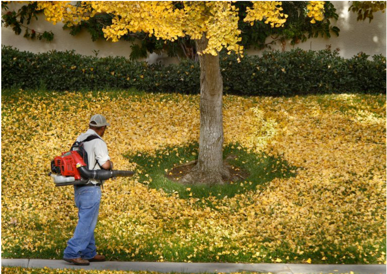
A landscaper uses a leaf blower in Irvine, California.

Oct. 13, 2021 at 5:00 am Updated Oct. 13, 2021 at 5:16 am