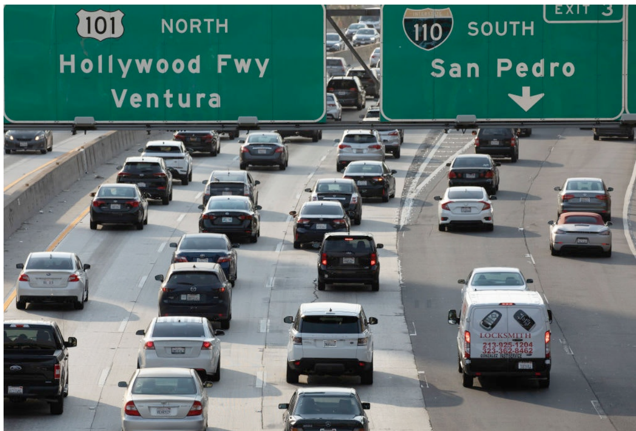
Above, a defect of modern urban life.

Which do you think is overall a greater contributor to certain kinds of air pollution, carcinogenic emissions, lung disease, and hearing loss, in our nation's most populous state?