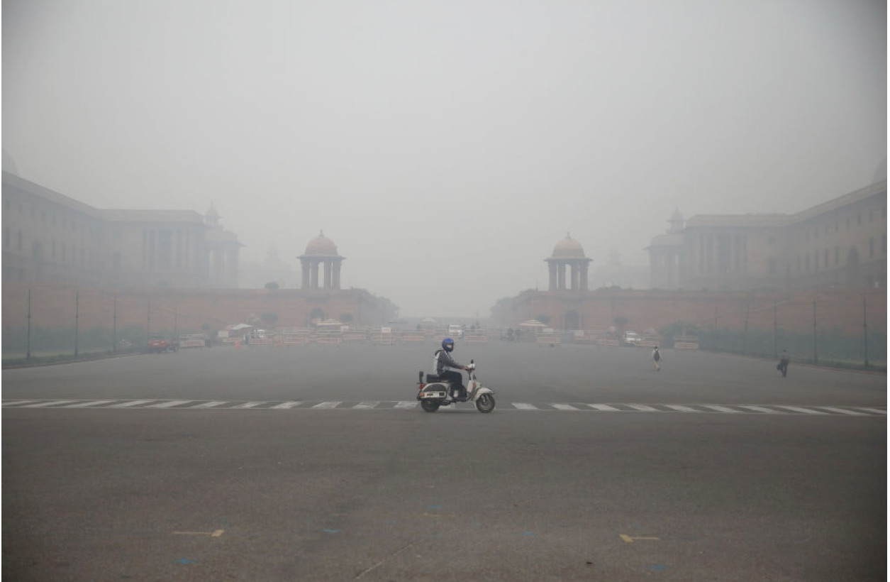
A two-stroke scooter in New Delhi.

But these machines persist in American landscaping because they are cheap . And because—to be brutally honest—the people paying the greatest price in much of suburban American are the hired lawn-crew workers.