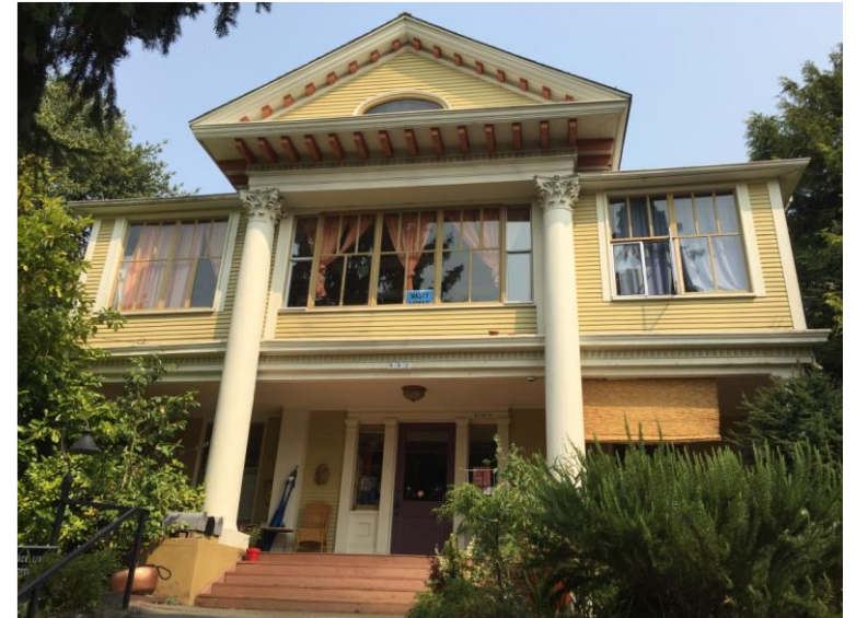
Contemporary photo, 2019