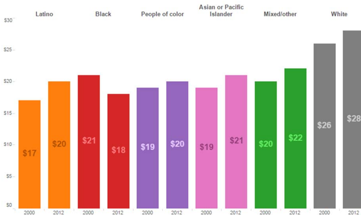
Race and ethnicity categories based on source data and do not necessarily match U.S. Census categories.

Washington State ranks 47 th in the nation in funding for mental health and substance abuse treatment services. 7 Untreated mental health and addictions are a leading cause of homelessness. Outreach workers have reported that as many as 90% of unsheltered people are struggling with these issues. The resulting impact is that increased numbers of people are living in marginalized situations, unstably housed and coping with untreated mental health and substance abuse conditions.