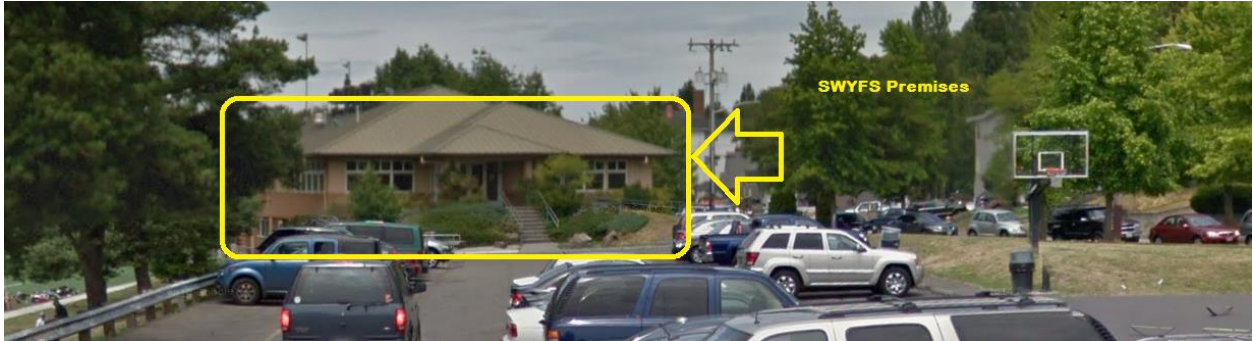
EXHIBIT A Site Premises Map