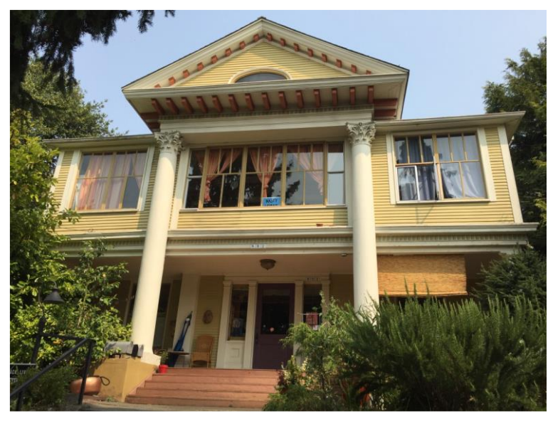
Contemporary photo, 2019