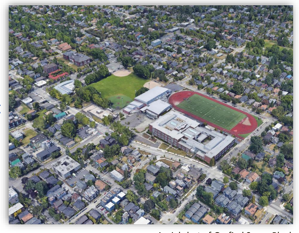
Aerial shot of Garfied Super Block