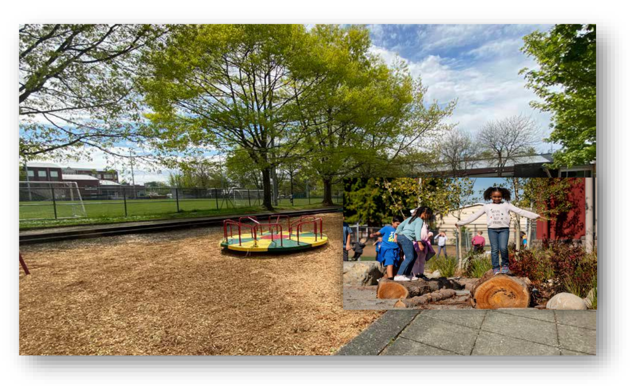
Garfield Super Block