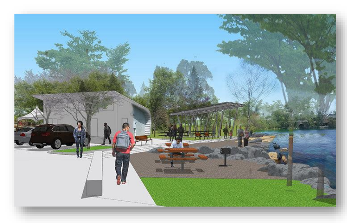
Be'er Sheva Park Phase 2