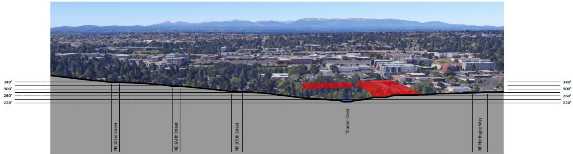
SITE SECTION A-A (LOOKING WEST)