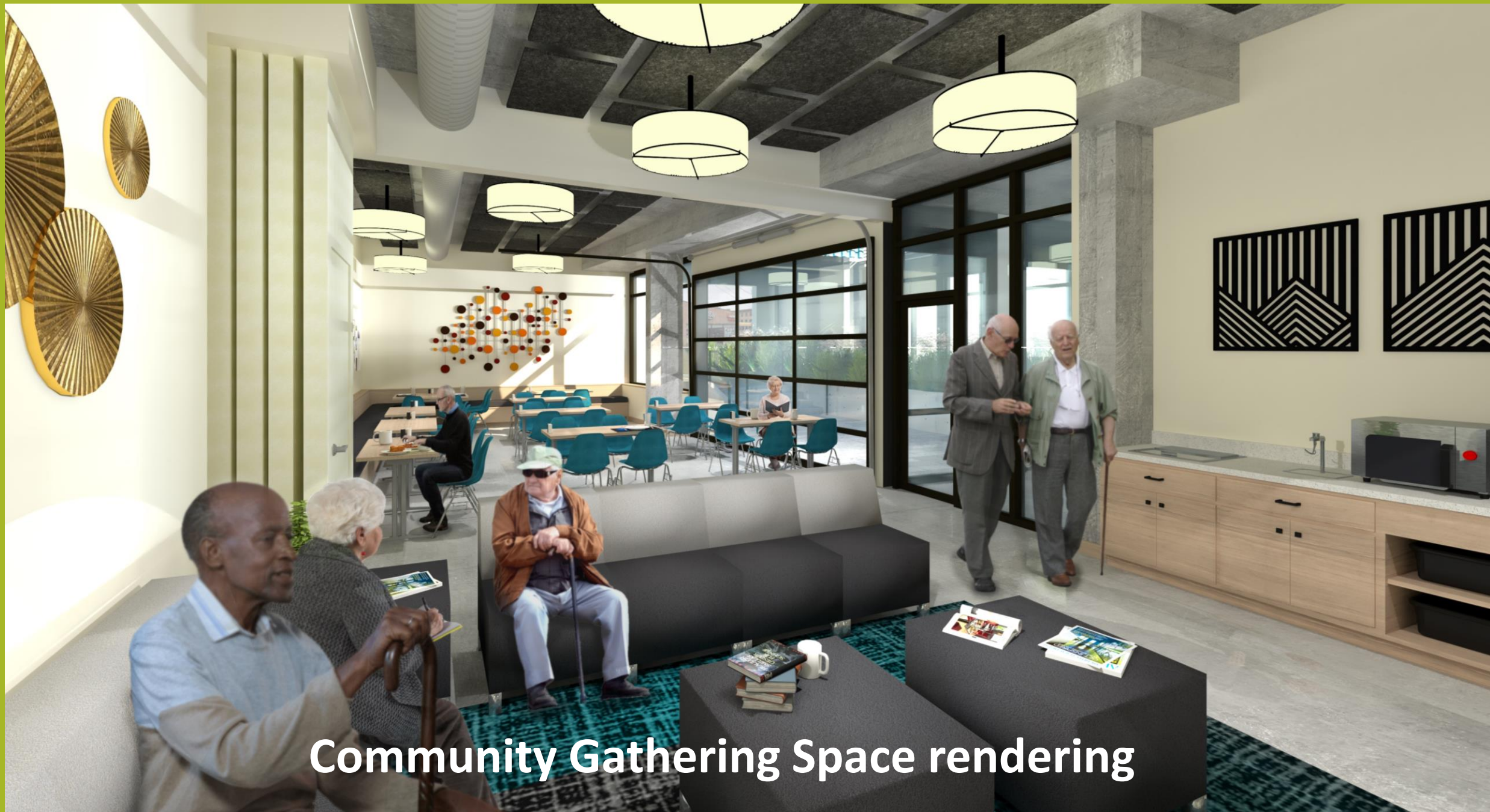
Community Gathering Space rendering