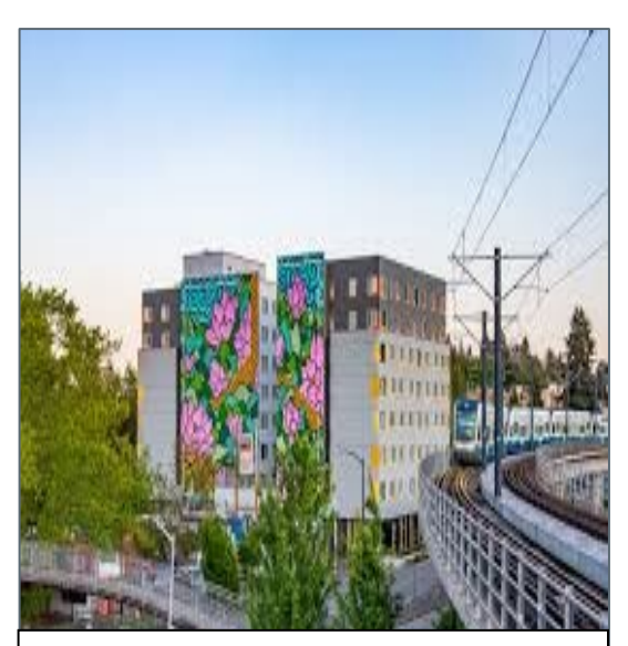
AFFORDABLE HOUSING RENTAL PRODUCTION IN ACTION

Progress Toward 7-year Goal: Goal exceeded