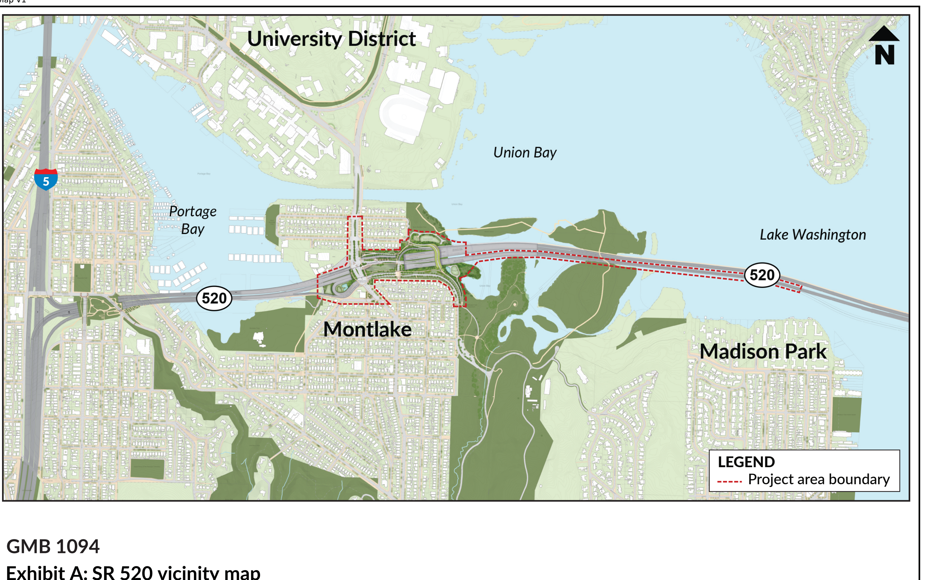
Exhibit A: SR 520 vicinity map