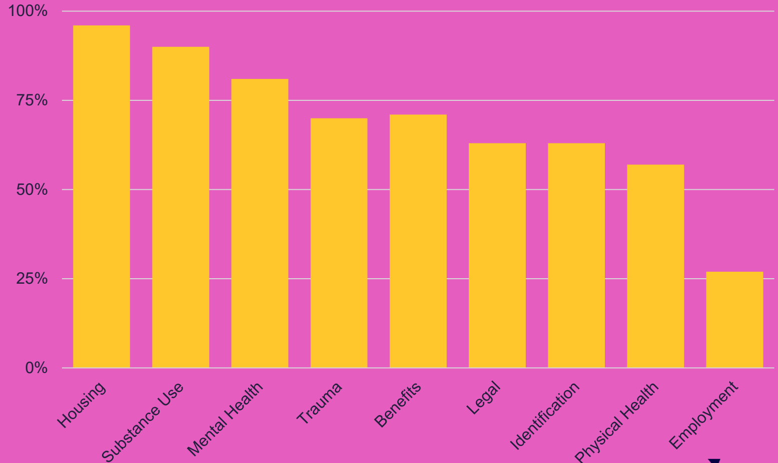
Types of Support Requested

88% of Encampment Participants are seeking support with substance use.