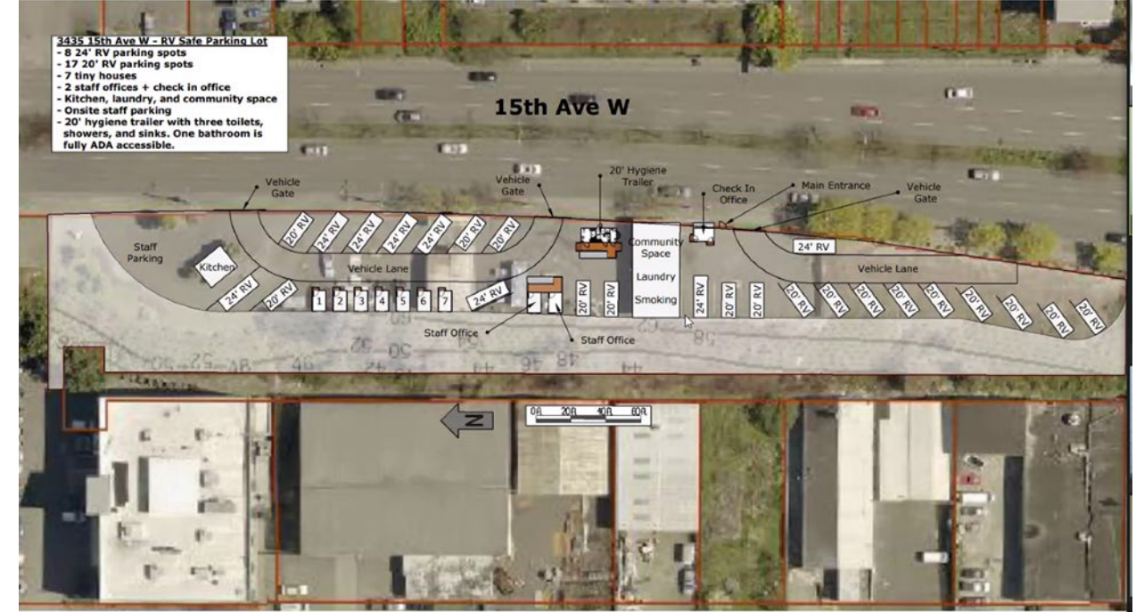
* Site plan has been subsequently revised.