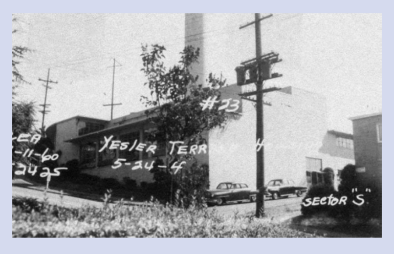
Historic photo, 1960