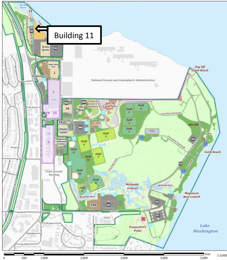
Warren G. Magnuson Park Building 11 Floorplan -2 nd floor