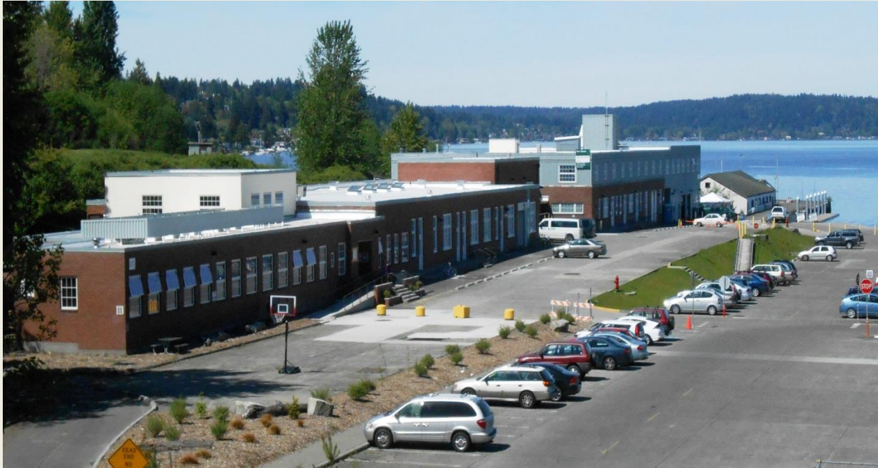
Boyer Children's Clinic Building 11 – Magnuson Park