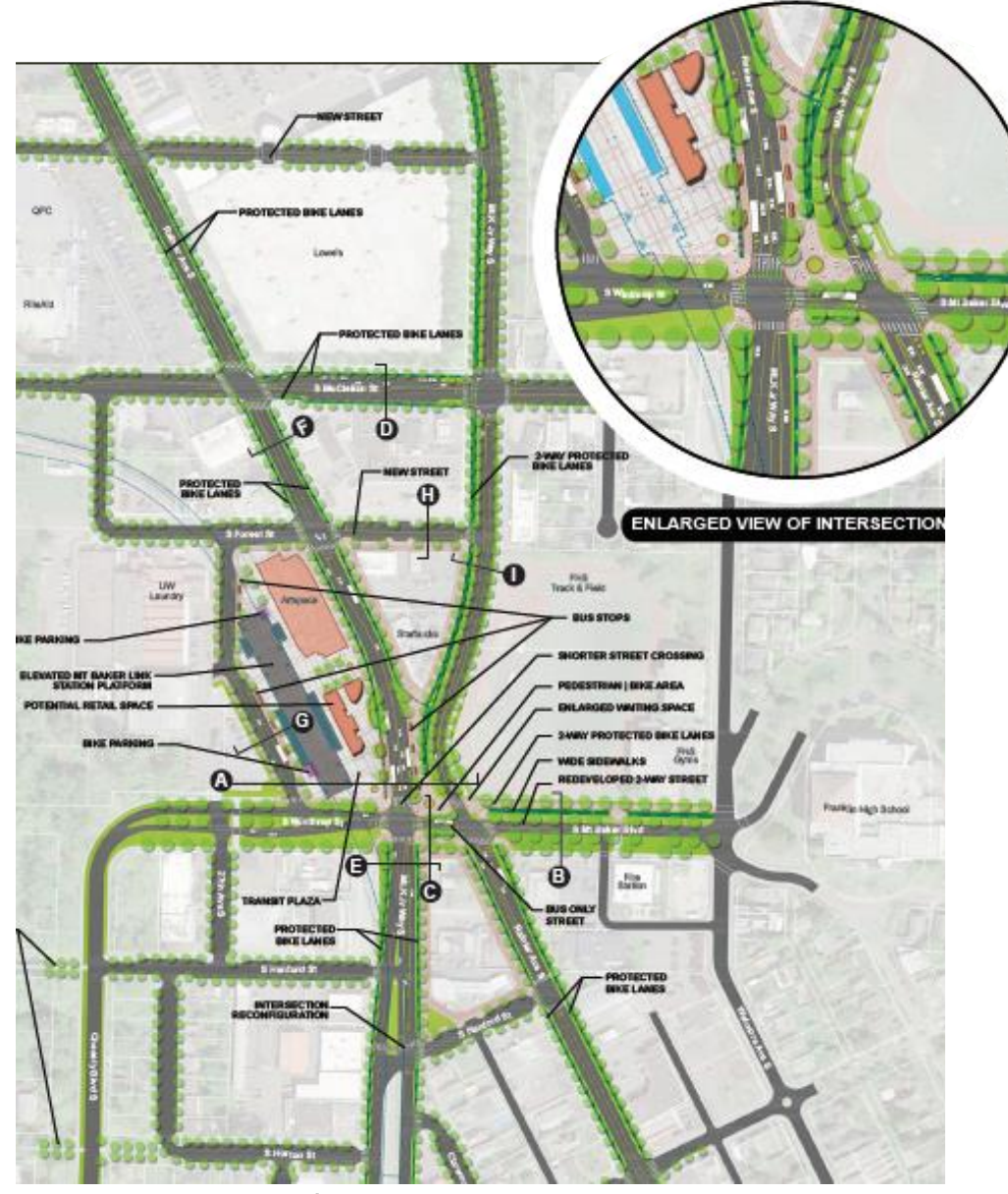
Mt. Baker Station improvements