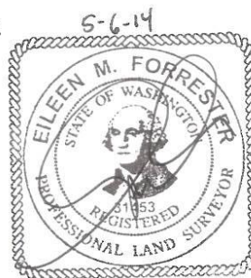
Exhibit "B" attached and by this reference made a part hereof.

Containing: 17,271 square feet, more or less.