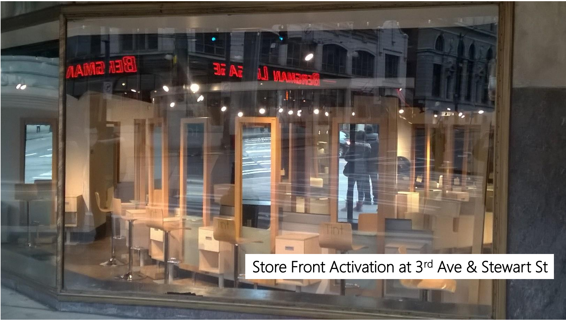
Store Front Activation at 3 rd Ave & Stewart St