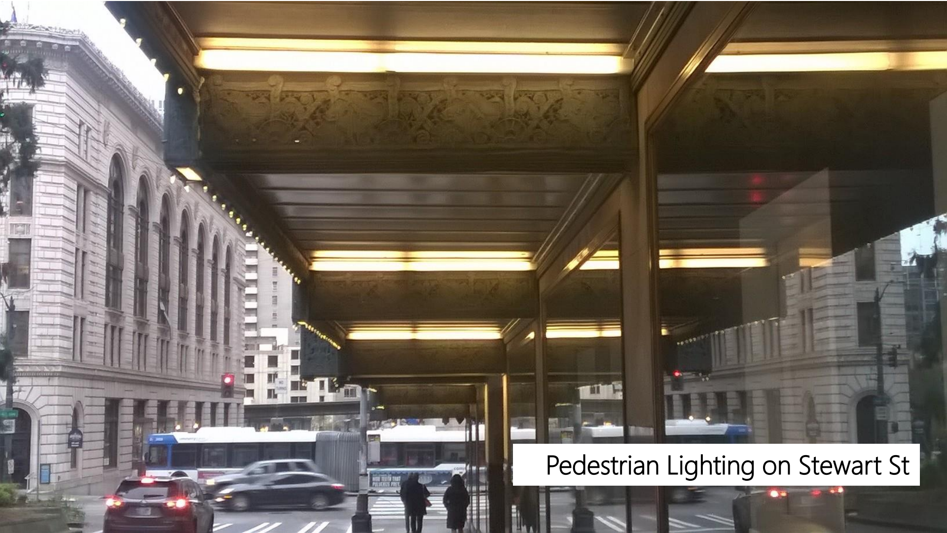
Pedestrian Lighting on Stewart St