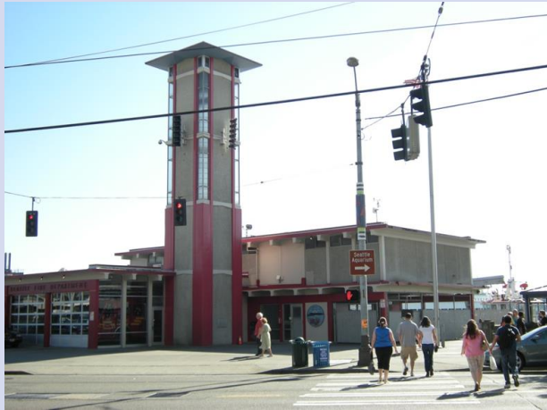
Current photo, 2014