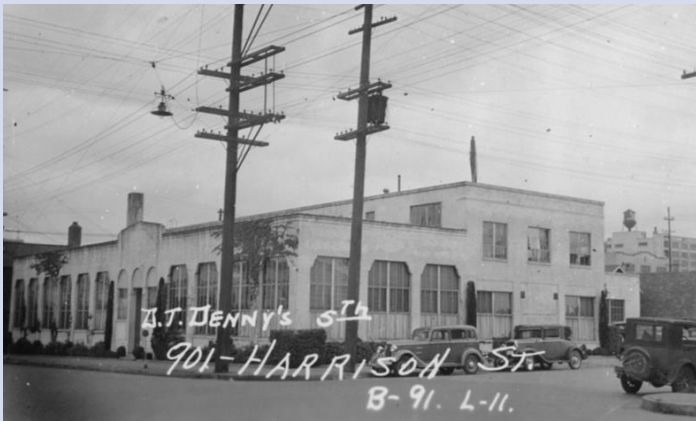
Historic photo, c. 1937