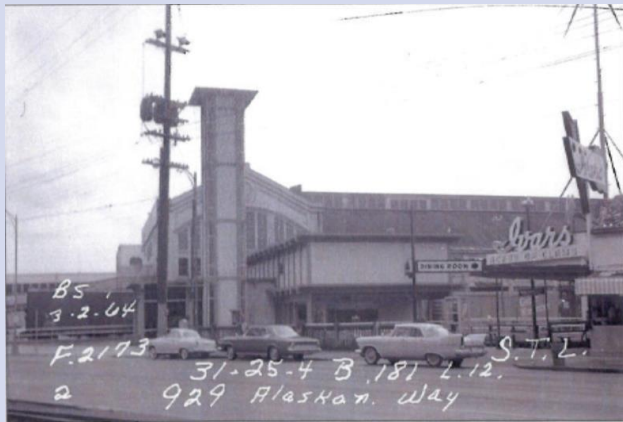
Historic photo, c. 1964