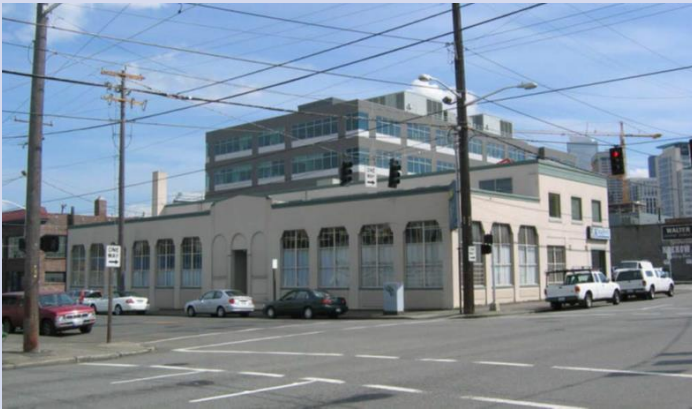
Current photo, 2014